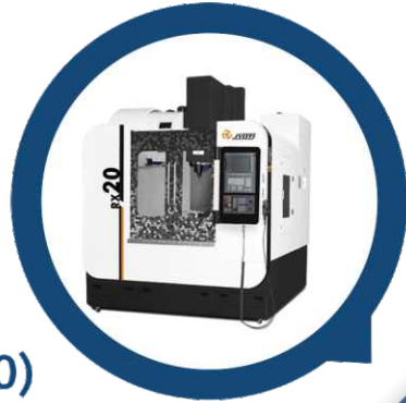
JYOTI - VERTICAL MILLING MACHINE (RX 20)